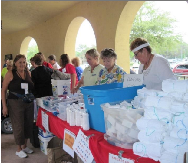
Piles of wash cloths, shaving cream, razors, etc. ready.